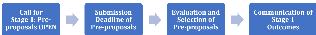
Figure 2: Stage 1 step-by-step process

The Call process consists of two (2), separate and consecutive stages as per flow charts below: